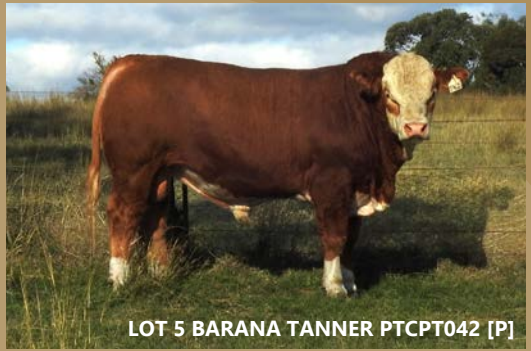
LOT 5 BARANA TANNER PTCPT042 [P]