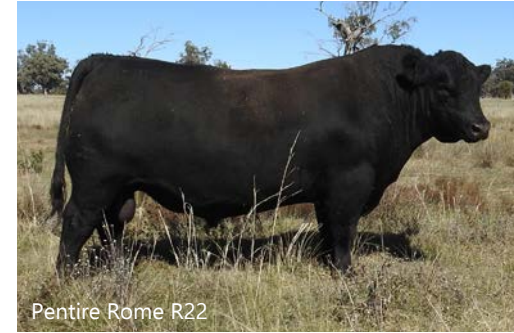
Pentire Rome R22

Sire HF ALCATRAZ 60F PV MAY-WAY BREAKOUT 1310 Dam PENTIRE PRIDE H36Y SV S A V PIONEER 7301 HF MAYFLOWER 191Z PV Pentire Pide F35