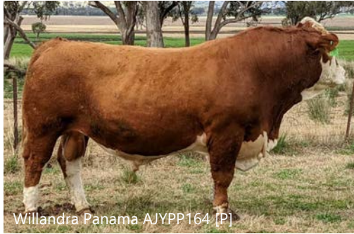
Willandra Panama AJYPP164 [P]

Sire TOPWEIGHT JACK ARTA (P) Woonallee Flamboyant (P) Dam WILLANDRA OLIVE B70 (H) MAJ ROBO (AI) Topweight Bettina 333 (P) Quaindering Olive V19 (H)