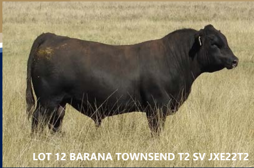
LOT 12 BARANA TOWNSEND T2 SV JXE22T2