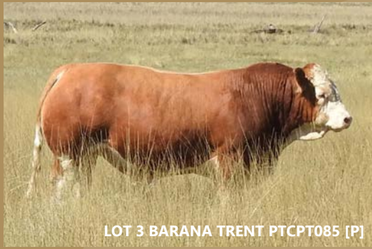
LOT 3 BARANA TRENT PTCPT085 [P]