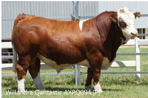
Willandra Qantastic AYPQ094 [P]

Sire WEEPJ092 WOONALLEE JERICHO (P) WEEPC120 Woonallee BHR Tornado (P) Dam AJYPG116 WILLANDRA EVITA G116 (H) Unavailable WEEPC087 Woonallee Vasti C87 (H)(ET)(AI) AJYPE105 Willandra Evita E105 (H)