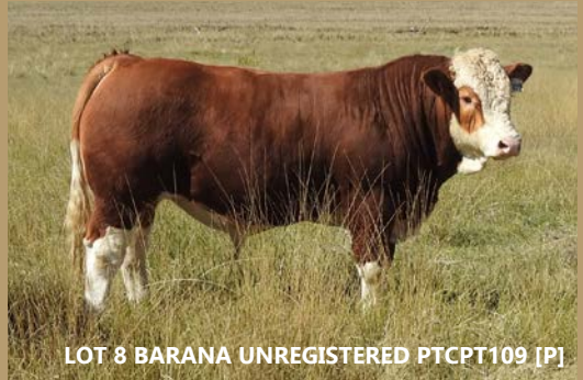
LOT 8 BARANA UNREGISTERED PTCPT109 [P]