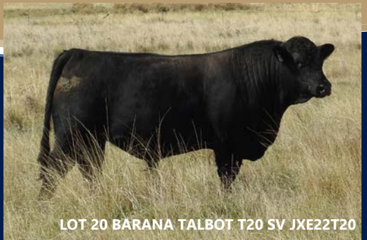
LOT 20 BARANA TALBOT T20 SV JXE22T20