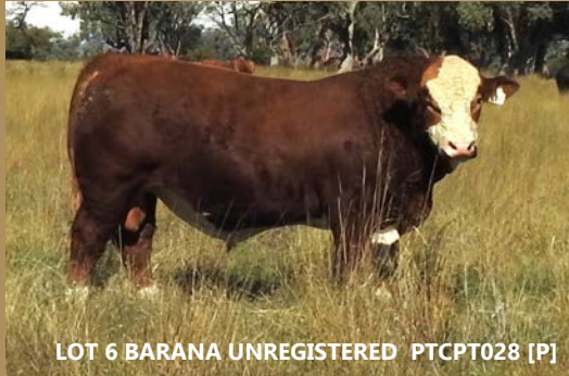
LOT 6 BARANA UNREGISTERED PTCPT028 [P]